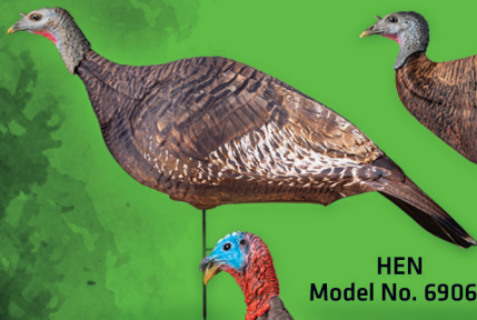
HEN Model No. 69068